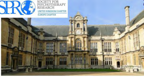
Oxford Conference, 20-22 September 2017