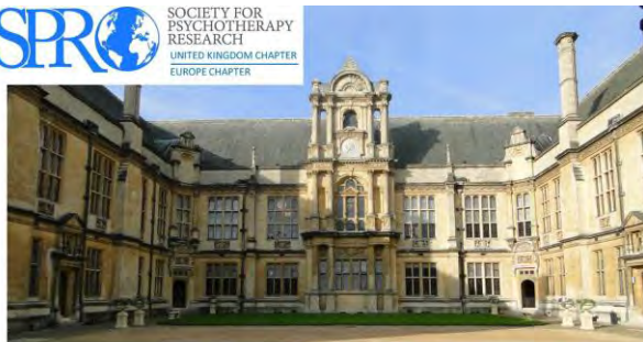
Oxford Conference, 20-22 September 2017