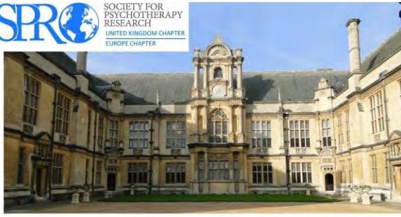
Oxford Conference, 20-22 September 2017