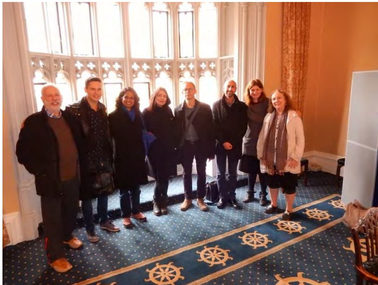
Members of the Oxford conference committee